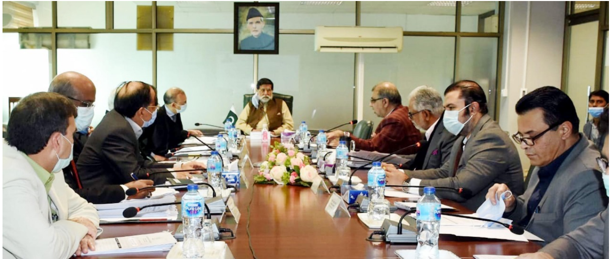
THE PRIVATISATION COMMISSION (PC) BOARD MEETING HELD IN ISLAMABAD ON JANUARY 21, 2021 UNDER THE CHAIRMANSHIP OF FEDERAL MINISTER PRIVATISATION, MOHAMMEDMIAN SOOMRO.