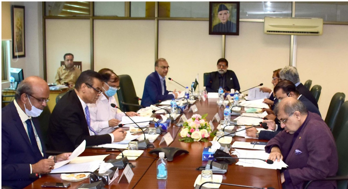
FEDERAL MINISTER FOR PRIVATISATION, MOHAMMEDMIAN SOOMRO CHAIRED THE PRIVATISATION COMMISSION BOARD MEETING IN ISLAMABAD ON JUNE 03, 2021.