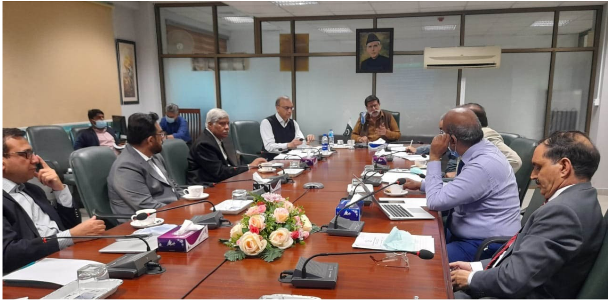
FEDERAL MINISTER FOR PRIVATISATION MOHAMMEDMIAN SOOMRO CHAIRED A MEETING ON PRIVATIZATION TRANSACTIONS UPDATE IN ISLAMABAD ON FEBRUARY 18, 2021.