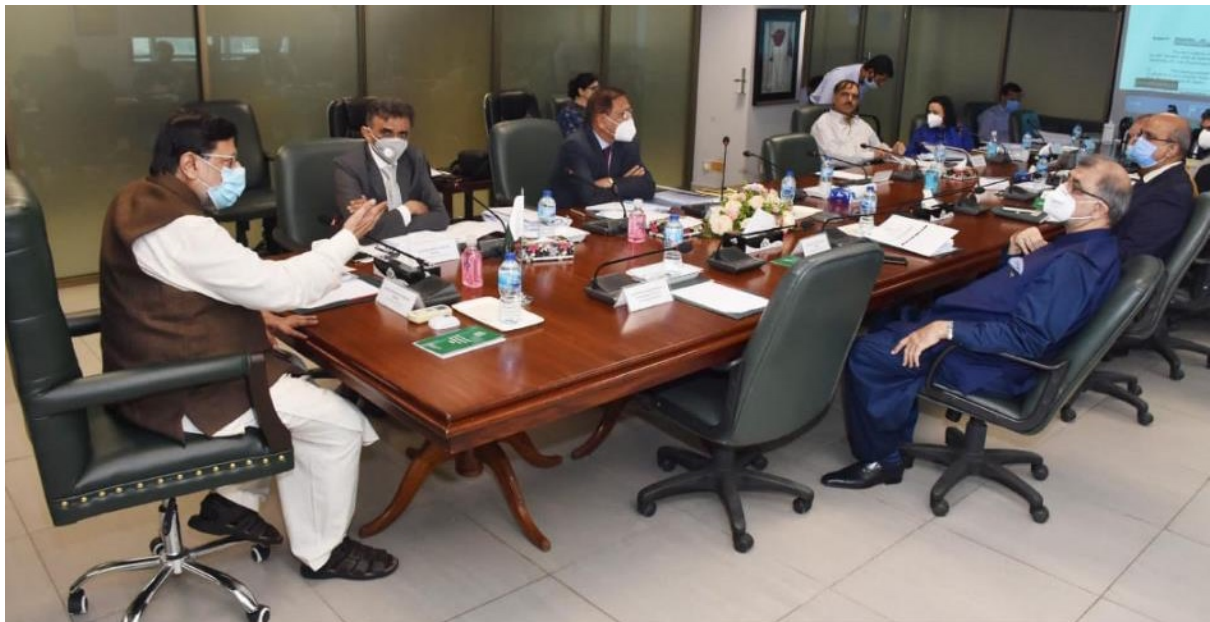
Federal Minister / Chairman for Privatization, Mohammedmian Soomro chaired the Privatization Board meeting to discuss left-over items of the previous Board meeting in Islamabad on July 29, 2020.