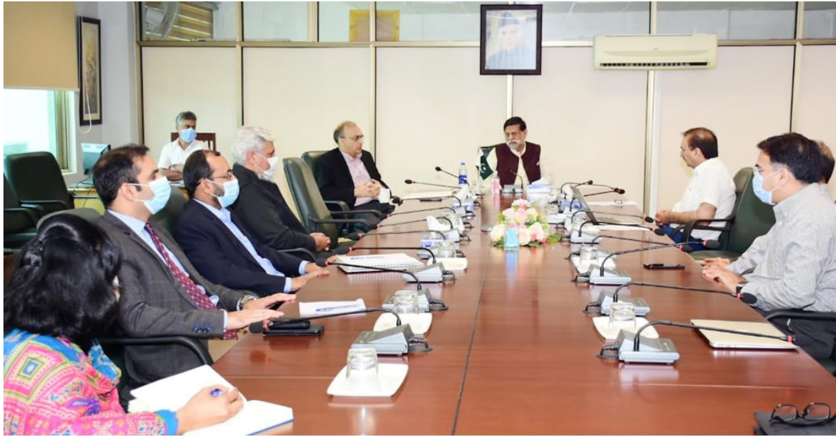
FEDERAL MINISTER FOR PRIVATISATION, MOHAMMEDMIAN SOOMRO CHAIRED A MEETING REGARDING PRIVATISATION PROGRESS IN ISLAMABAD ON JUNE 16, 2021.