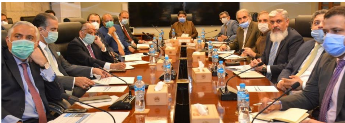
Federal Minister for Privatization Muhammad Mian Somroo Chairing a Meeting with Head of Banks, at State Bank of Pakistan Karachi on July 23, 2020