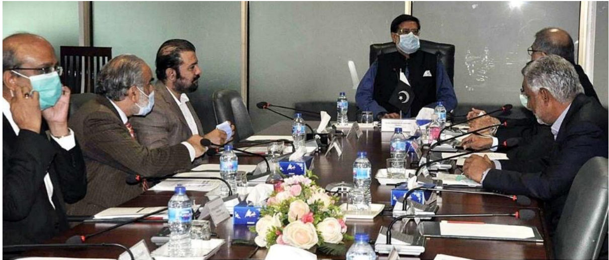
APP46-23 ISLAMABAD: September 23 - Federal Minister for Privatisation Mohammedmian Soomro chairing a Privatisation Commission Board meeting.