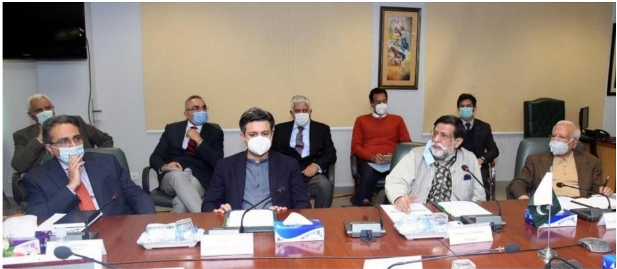
THE FIRST MEETING OF THE COMMITTEE (CONSTITUTED BY CCOP) HELD TODAY UNDER THE CHAIRMANSHIP OF FEDERAL MINISTER PRIVATISATION MOHAMMEDMIAN SOOMRO, IN THE MINISTRY OF PRIVATISATION, IN ISLAMABAD ON DECEMBER 10, 2020.