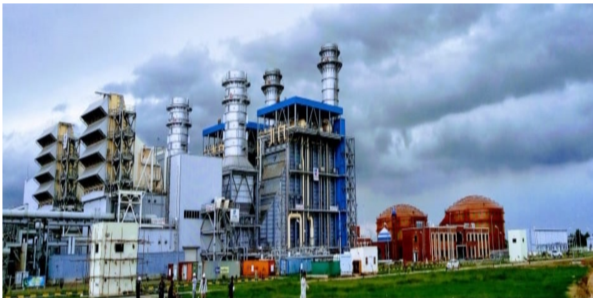
1223 MW Balloki Power Plant