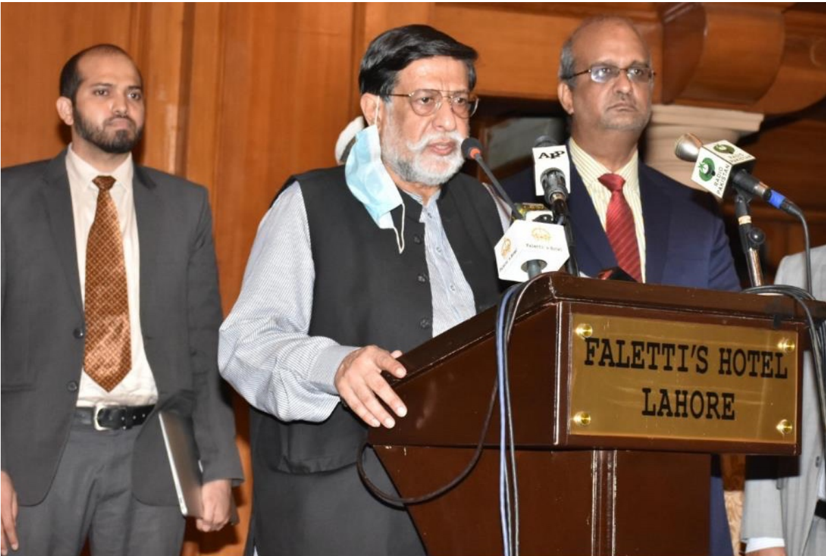
Federal Minister for Privatization, Mohammadmian Soomro talking to the media at the occasion of auction process of Federal Government Properties at Lahore on September 28, 2020