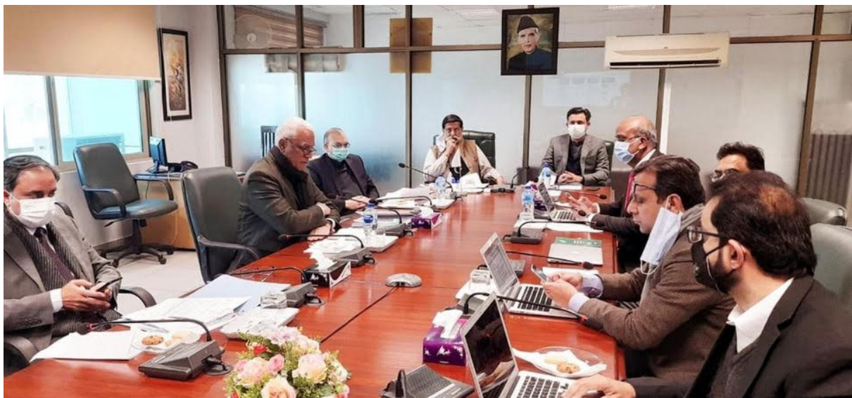
FEDERAL MINISTER FOR PRIVATISATION, MOHAMMEDMIAN SOOMRO AND FEDERAL MINISTER FOR INDUSTRIES & PRODUCTION, MUHAMMAD HAMMAD AZHAR CO-CHAIRLED AN IMPORTANT MEETING REGARDING PAKISTAN STEEL MILLS (PSM) AND TRANSACTION UPDATES IN ISLAMABAD ON JANUARY 26, 2021.