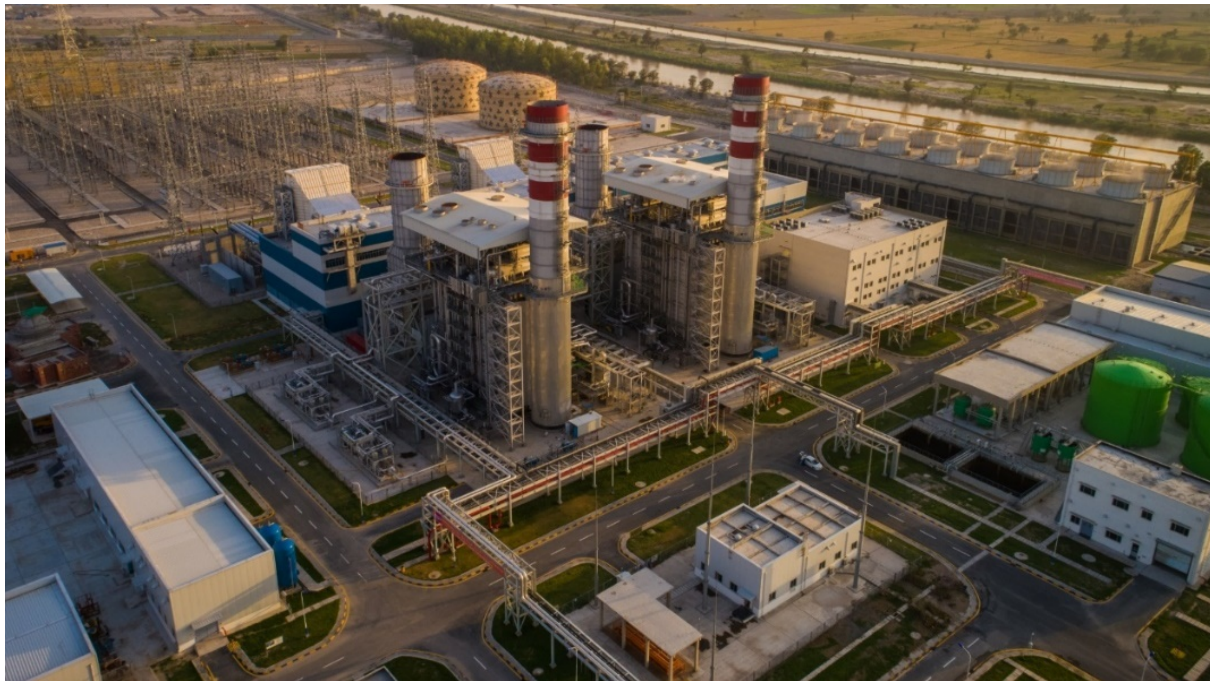
1230 MW Haveli Bahadur Shah

National Power Parks Management Company Private Limited was established in 2015 and entrusted with the task to inject 2400 MW into the national system. Accordingly, the company established two Re-gasified Liquid Natural Gas (RLNG) based Combined Cycle Power Plants; 1223 MW CCPP at Balloki, District Kasur and 1230 MW CCPP at Haveli Bahadur Shah, Jhang during 2018. The company has its offices in Lahore and Islamabad.